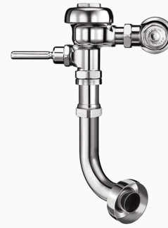
Variation Not Shown: Trap Primer